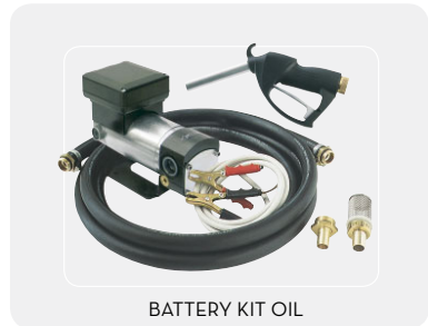
BATTERY KIT OIL