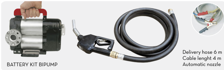
BATTERY KIT BIPUMP

Delivery hose 6 m Cable lenght 4 m Automatic nozzle