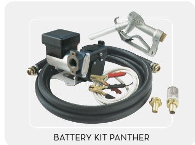
BATTERY KIT PANTHER

Delivery hose 6 m Cable lenght 4 m Automatic nozzle