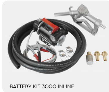
BATTERY KIT 3000 INLINE