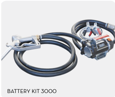
BATTERY KIT 3000