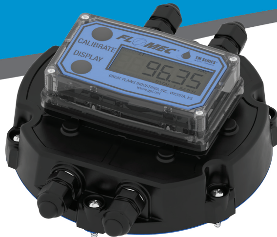
QSI with 09 DISPLAY

*Energy Consumption can be displayed on the FLOMEC App, or transmitted out via RS485 or pulse out.