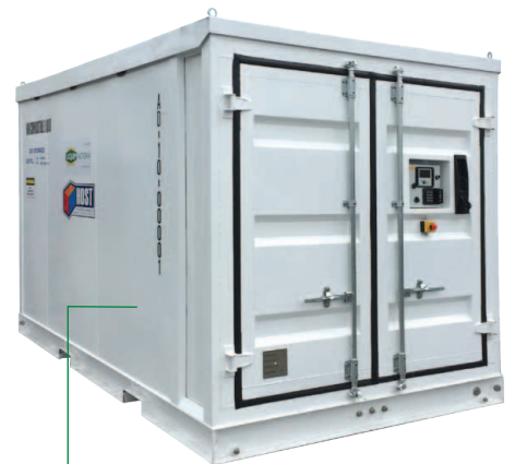
Insulated Stainless Steel internal tank

Including high quality stainless steel fittings throughout and many other valuable features as standard, HOST AdBlue Self Bunded Tanks really stack up on design and value.