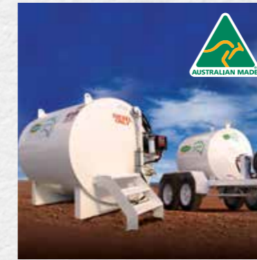
Australian Made Single Wall Tanks