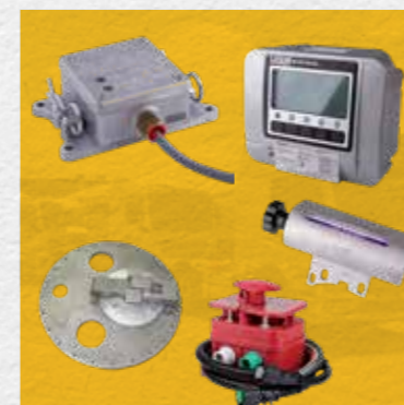
Tanker Equipment & Parts