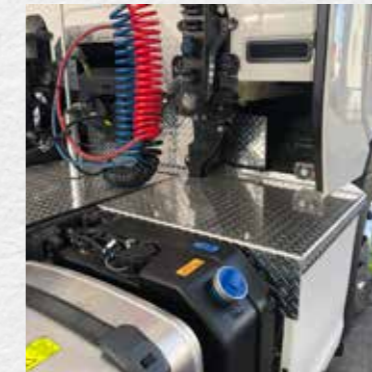
Truck Flame Proofing