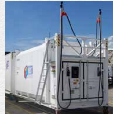
Bulk Fuel Storage