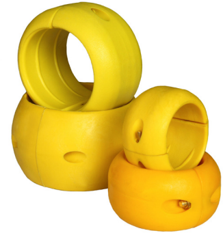
HB SERIES HOSE BEADS

It is common industry practice to fit hose beads on reels or deck hoses of aircraft refuelling or road tanker pumping vehicles. Hose beads assist in manoeuvring hose over the airport apron, while minimising wear and abrasion of the hose cover, and enhancing the visibility of the hose during low light refuelling operations.